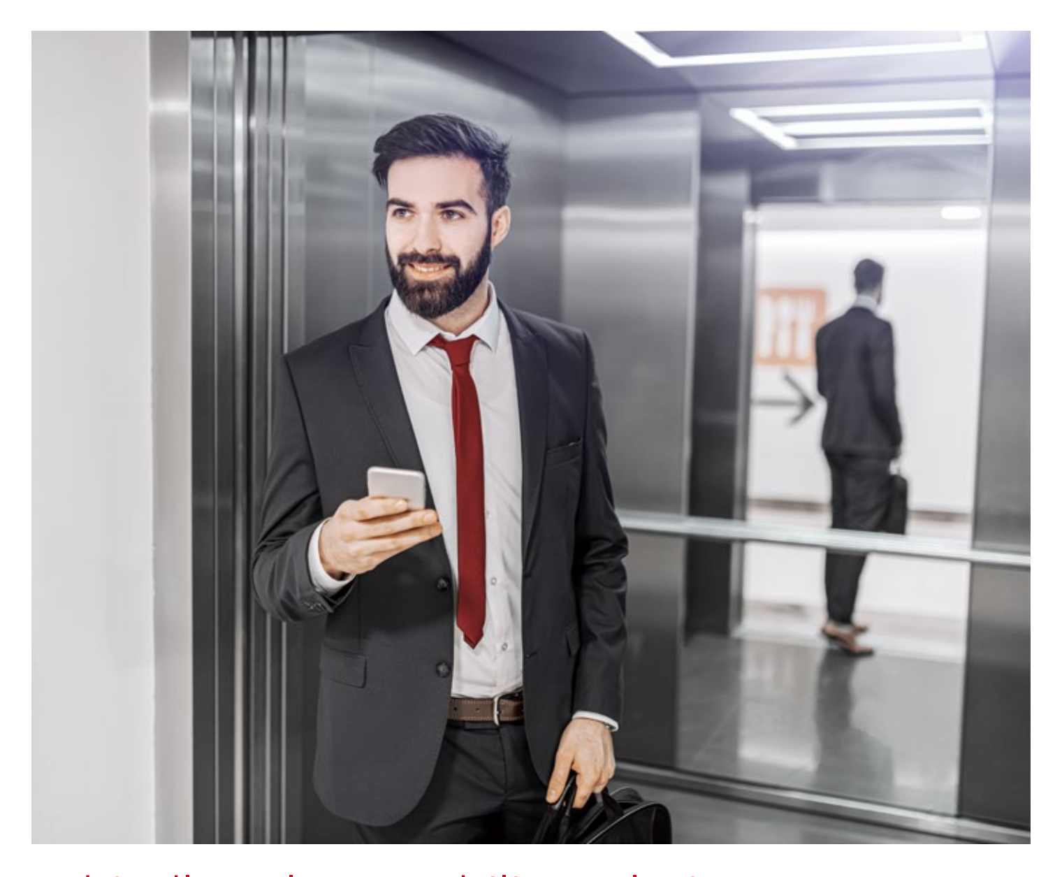
Schindler CleanMobility solutions Schindler Ahead ElevateMe