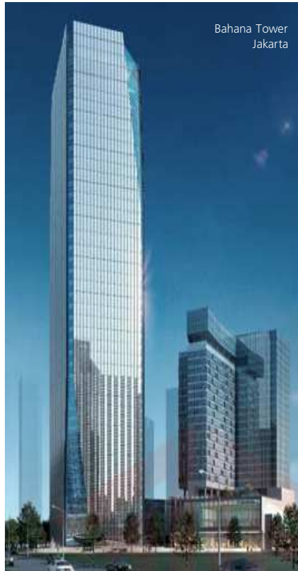
Bahana Tower Jakarta