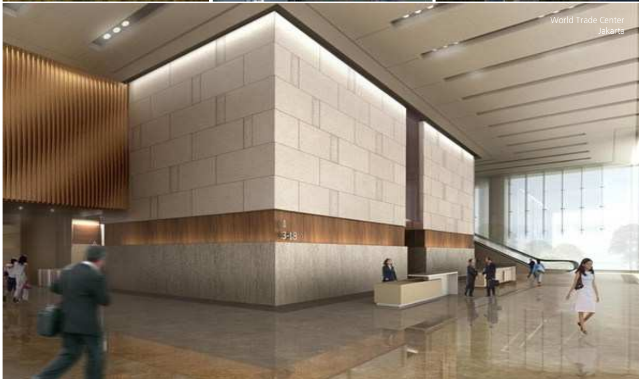
World Trade Center Jakarta