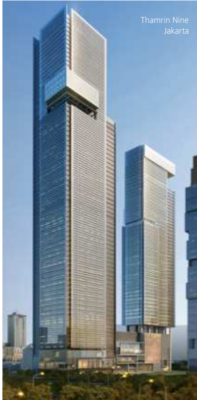
Thamrin Nine Jakarta