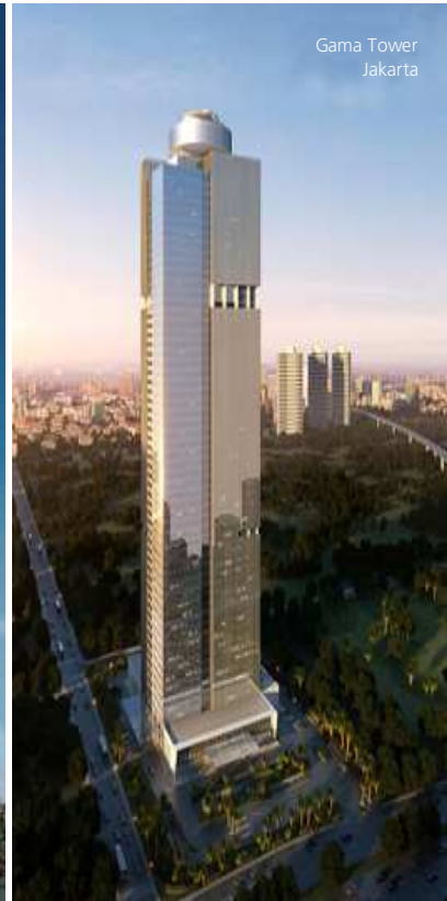
Gama Tower Jakarta